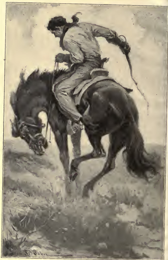
Calumet remained unshaken